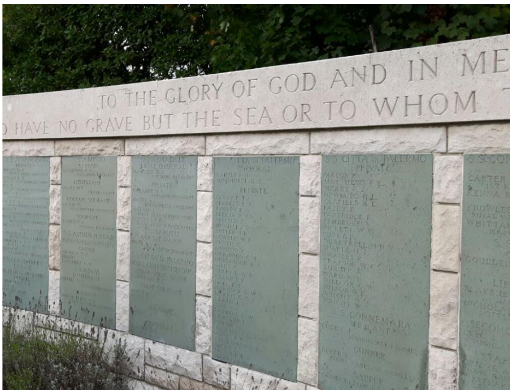
Name Panels behind Cross of Sacrifice